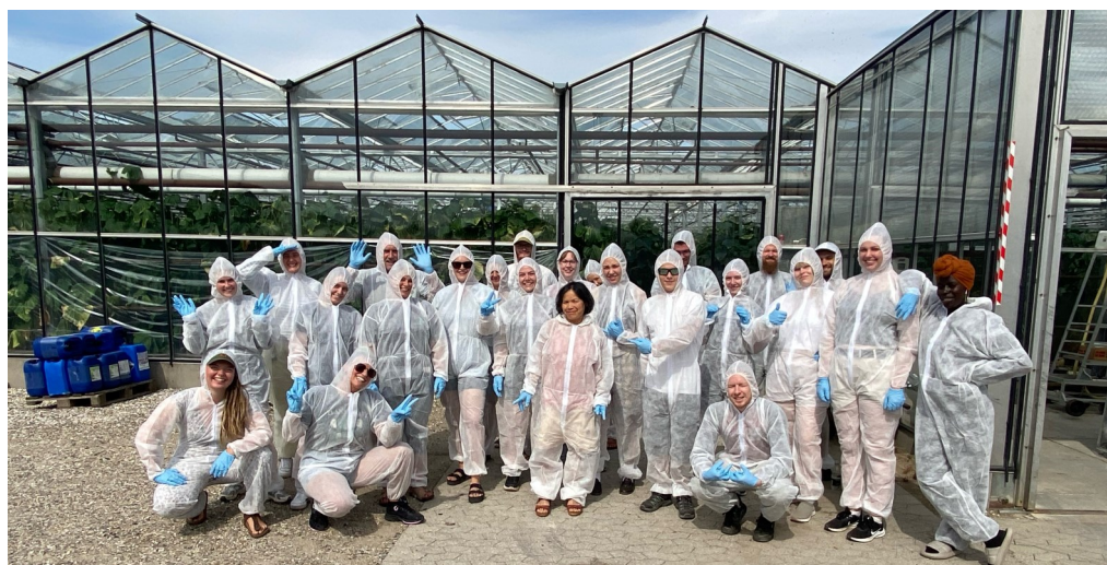
Students on a field trip to a local cucumber greenhouse in Roskilde, Denmark.

Furthermore, the students will be introduced to horticulture training in Denmark and the horticulture industry. The students will go on field trips where they for example see typical plant productions in greenhouses and nurseries as well as the sale of plants in garden centres.