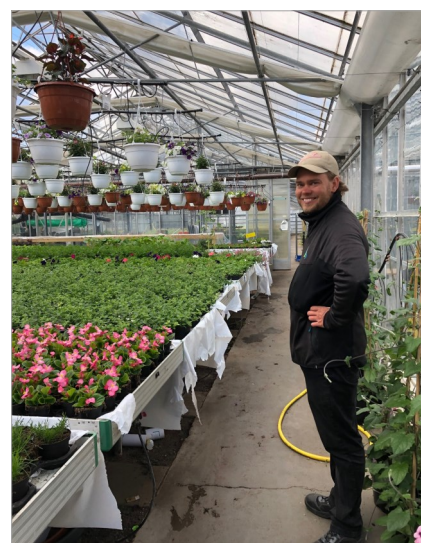
From the student production of plants in Roskilde.

Prerequisites: Basic gardening knowledge and basic understanding of oral English.