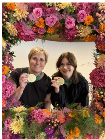
Award winning teacher & student