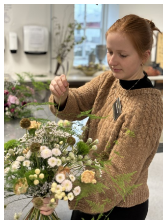
Euroskills competitor 2025