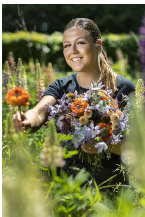
Student in school garden